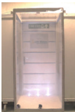
Smoke seals fitted head and jambs