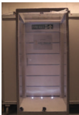
Smoke seals fitted head and jambs